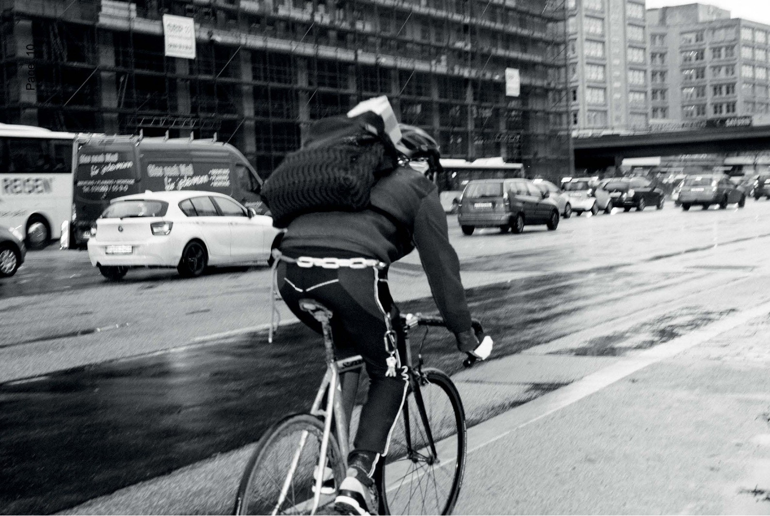
Berlin 10119, GER 52°31'40.9"N 13°24'43.8"E