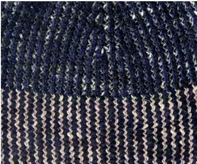
1310126 Page 11