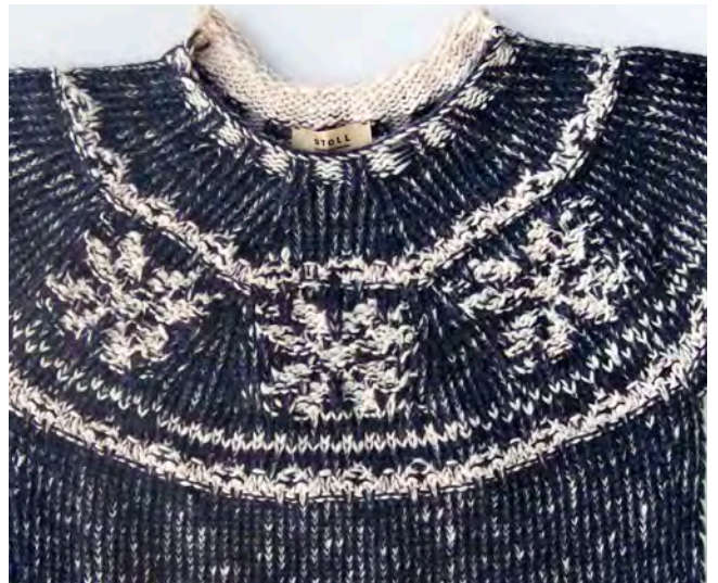
1310120 Page 12/13