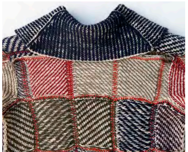
1310095 Page 30/31