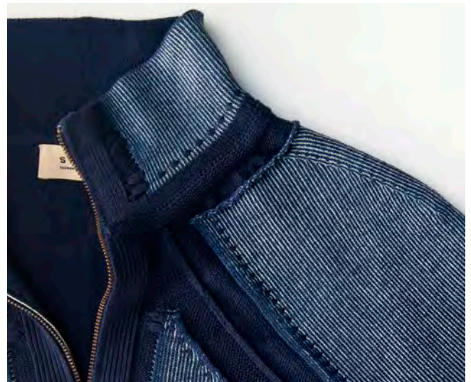
1310048 Page 32/33