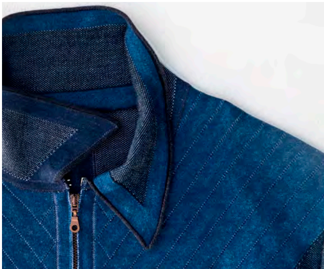
1310058 Page 36/37