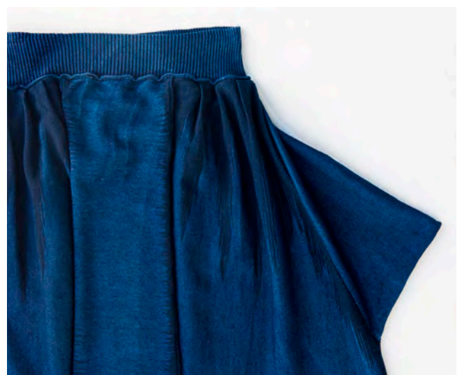
1310147 Page 43