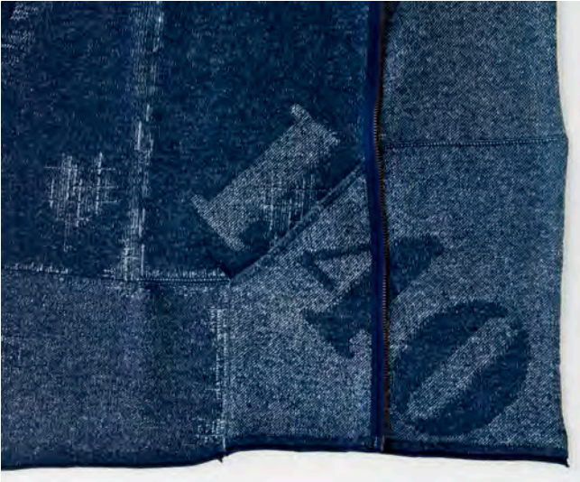
1310072 Page 20/21