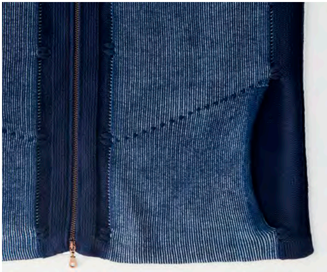
1310048 Page 32/33