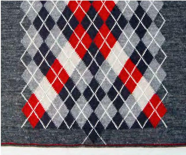
1310056 Page 10