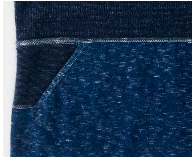
1310091 Page 38/39