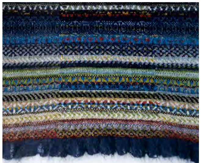
1310079 Page 14/15