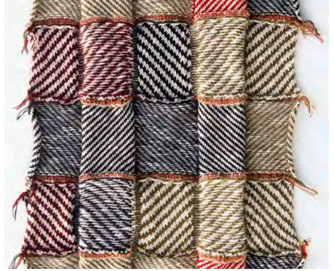
1310112 Page 18/19