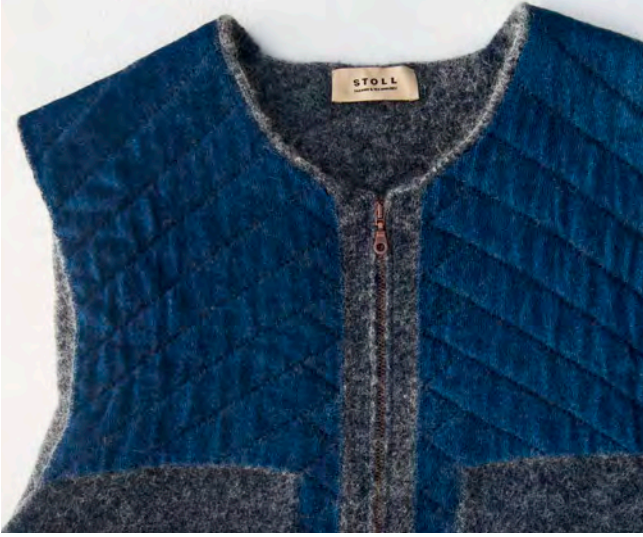
1310046 Page 16/17