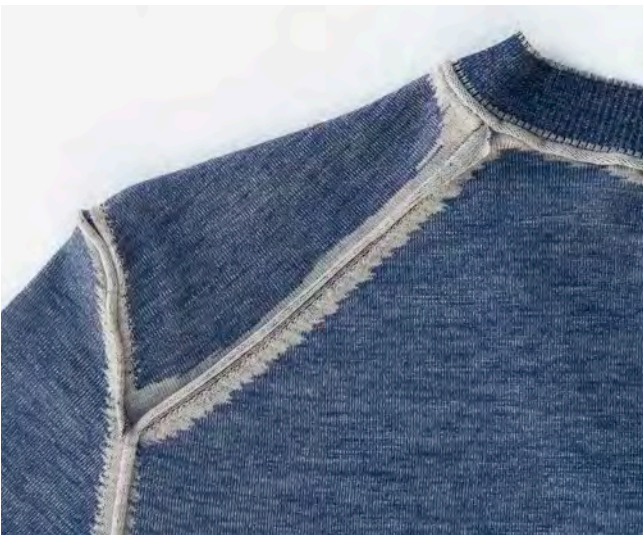
1310066 Page 28/29