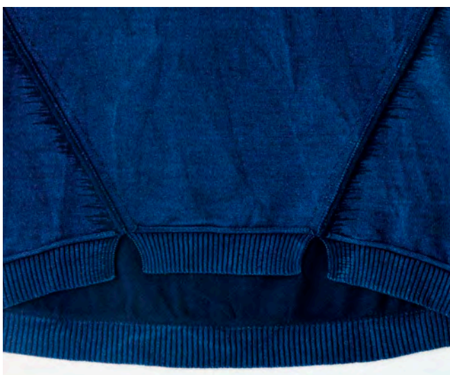
1310132 Page 42