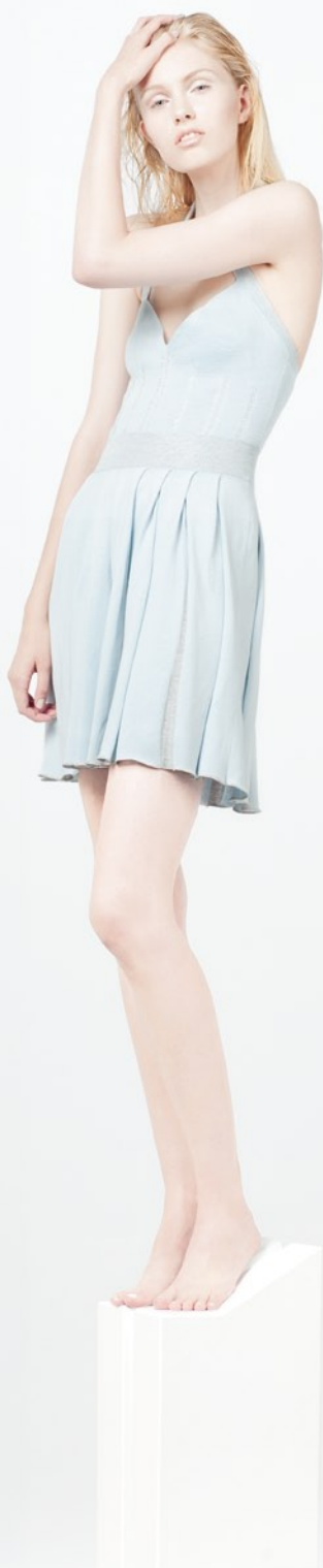
0910273 CMS 530 MULTI GAUGE E 7.2 FULLY FASHION HALTER-NECK DRESS WITH ORNAMENTAL STITCHES ON THE UPPER PART; PLEATED SKIRT WITH INTARSIA JERSEY STRUCTURE; WAISTLINE IN 1X1 HALF MILANO