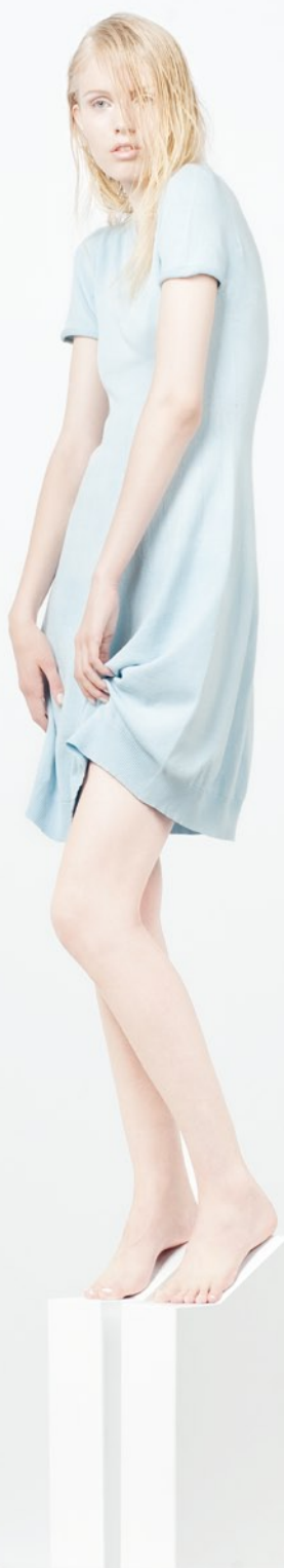
0910301 CMS 322 TC-M KNIT & WEAR E 7.2 STOLL-KNIT AND WEAR® JERSEY BALLOON DRESS WITH TUCK STITCHES ARRANGED IN FAIR ISLE AND PLEATED SHOULDERS