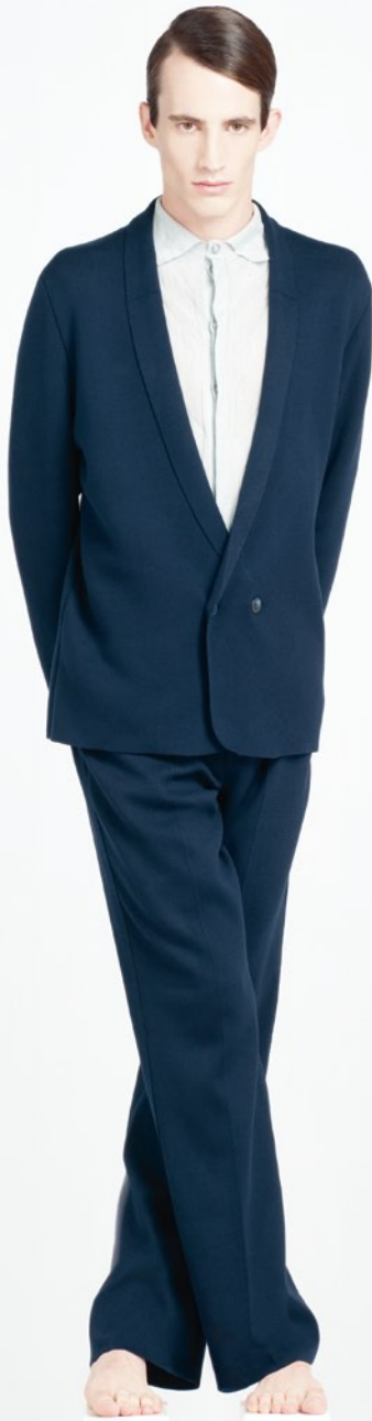
0910479 CMS 530 MULTI GAUGE E 7.2 FULLY FASHION BLAZER IN INTERLOCK WITH SHAWL COLLAR