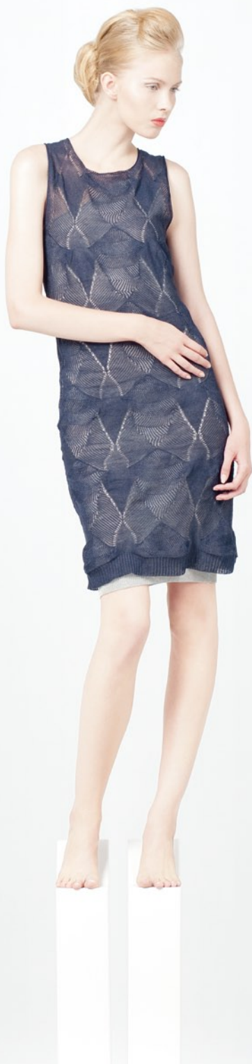
0910511 CMS 740 E 7.2 FITTED FULLY FASHION DRESS WITH POINTELLE STRUCTURES AND RACKED AND TUCKED PATTERN